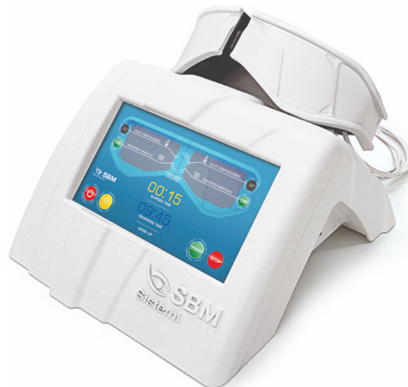
Fig. 1 The Activa mask (SBM Sistemi, Turin, Italy)

Patients were treated with a recently developed eye mask (Activa, SBM Sistemi, Turin, Italy) (Fig. 1) for four sessions weekly. Technical details concerning the device and the procedure have been described previously [12]. Briefly, through a fully automated touch screen-controlled procedure, the device is able to melt the meibum inside the glands and simultaneously squeeze them. The entire treatment lasts 15 min